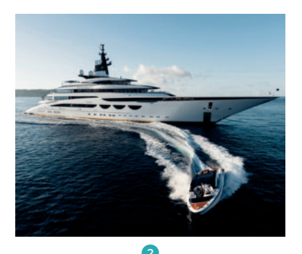
AHPO 378ft (115m), from $2.8m (€2.6m) per week for up to 16 guests in the Caribbean and Mediterranean