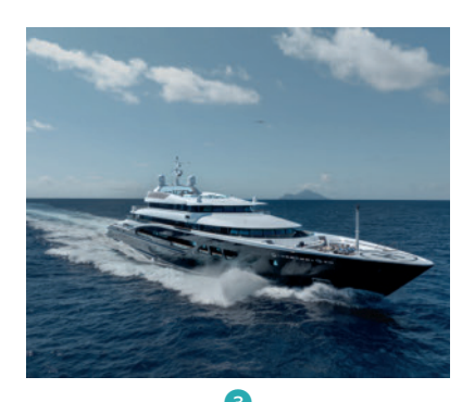
CARINTHIA VII 318ft (97m), from $1.5m (€1.4m) per week for up to 12 guests in the the Caribbean, Mediterranean and Mexico fraservachts.com