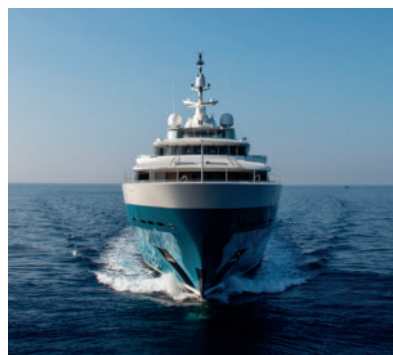
Below left The 280.6ft (85.5m) Sunrays is available to charter in the Red Sea this winter season. From $1,246,000 per week for up to 12 guests, edmistonyachts.com

dive compressor and replete with dive gear for qualified scuba divers, she is also an approved RYA water sports center, and her ample toy garage includes everything from SeaBobs to E-foils to Jet Surfs. For those preferring to stay dry, Sunrays's multiple tenders can take guests ashore to explore NEOM's new developments, including Sindalah; however, with the numerous facilities found on board, including spa, beauty salon, Jacuzzi, swimming pool, gym and steam room, you may run out of time to step ashore.