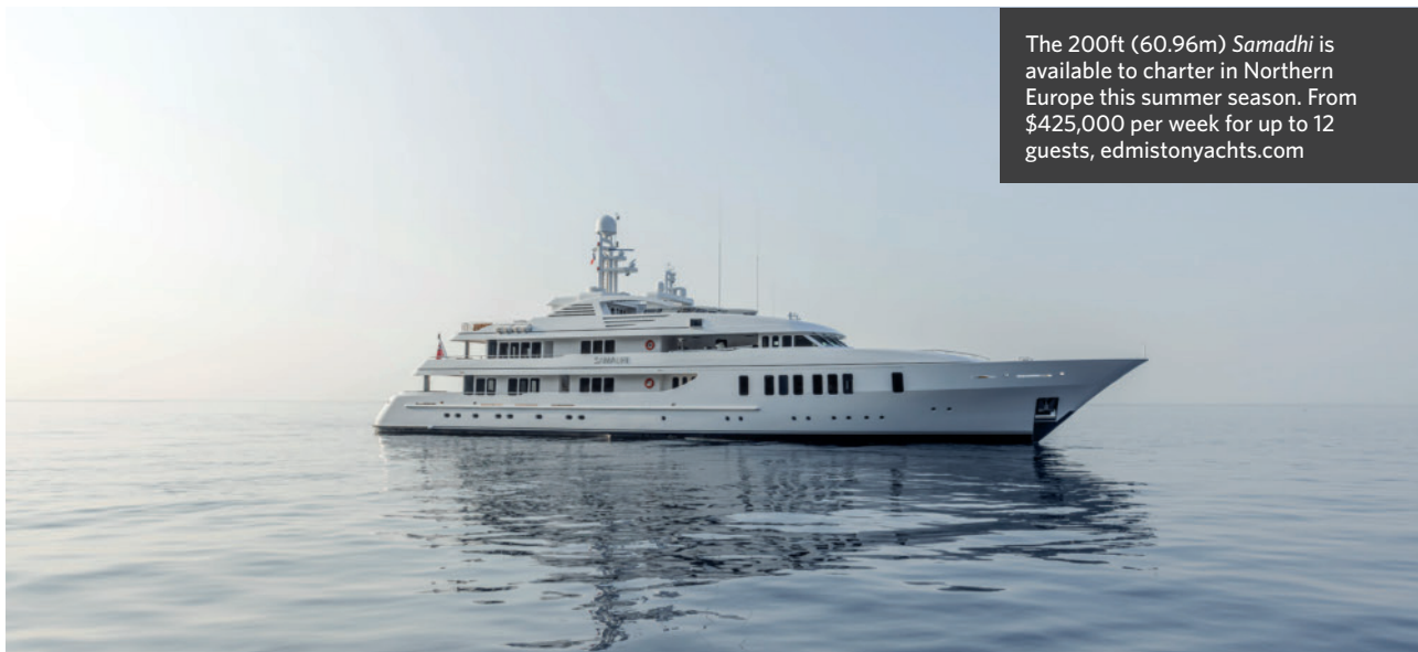
The 200ft (60.96m) Samadhi is available to charter in Northern Europe this summer season. From $425,000 per week for up to 12 guests, edmistonyachts.com