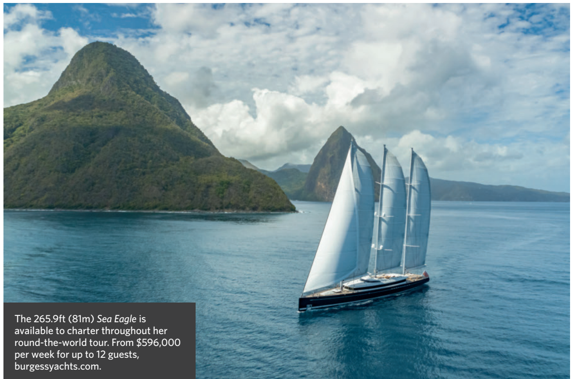
The 265.9ft (81m) Sea Eagle is available to charter throughout her round-the-world tour. From $596,000 per week for up to 12 guests, burgessyachts.com .

The high-performance flybridge ketch Twizzle also returns to the charter scene this summer season. The perennially popular charter yacht is a fine example of the trend for indoor-outdoor living spaces that eliminate the barrier between interior and exterior lounging and dining areas. Launched in 2010, the award-winning sailing yacht was well ahead of her time, encapsulating a new twist on standard yacht themes with versatile living and clutter-free decks and a large swim platform — all of which add to her universal appeal to this day. Fresh from a refit, her classic and timeless yet ultra-contemporary interior combined with minimal clutter, maximum technology and stellar craftsmanship ensure that Twizzle remains unique in the world of sailboats. She is the perfect sailing yacht for charters along the Mediterranean coastlines this summer season.