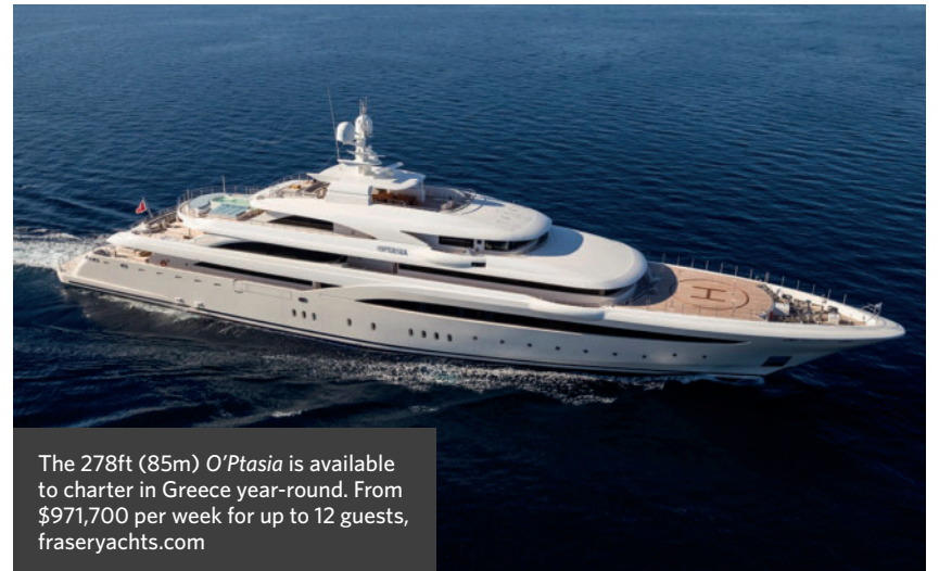
The 278ft (85m) O'Ptasia is available to charter in Greece year-round. From $971,700 per week for up to 12 guests, fraseryachts.com