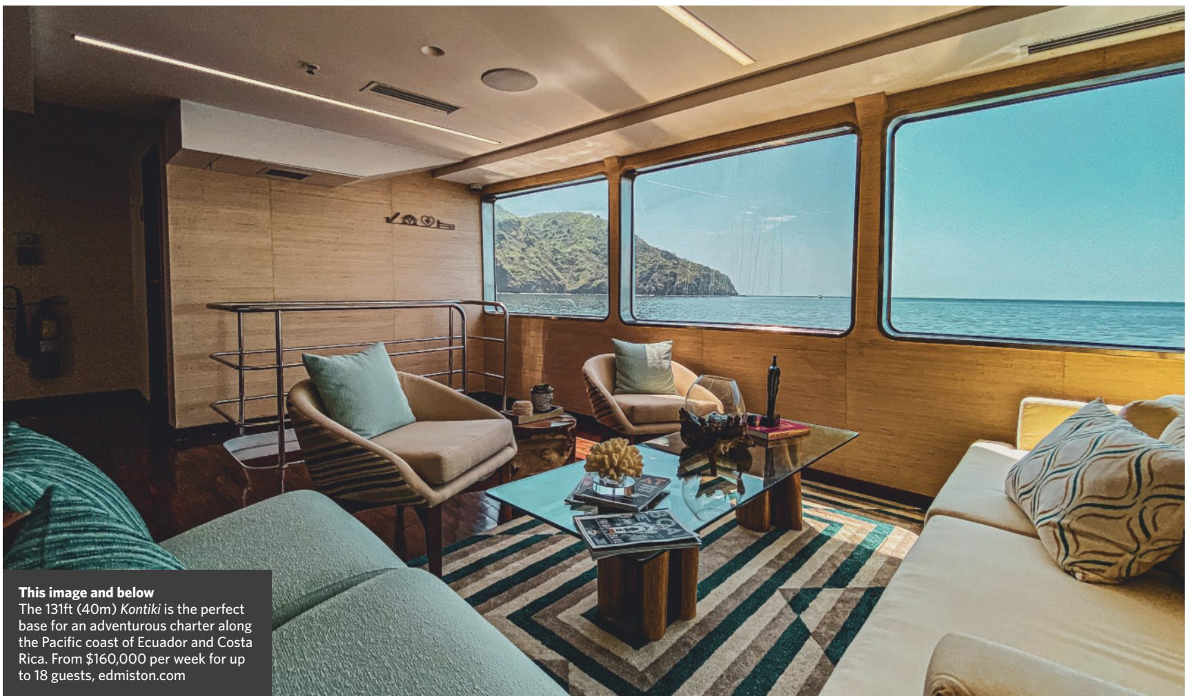
This image and below The 131ft (40m) Kontiki is the perfect base for an adventurous charter along the Pacific coast of Ecuador and Costa Rica. From $160,000 per week for up to 18 guests, edmiston.com